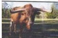
HORSE HEAD G WHIZ