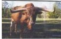
HORSE HEAD G WHIZ